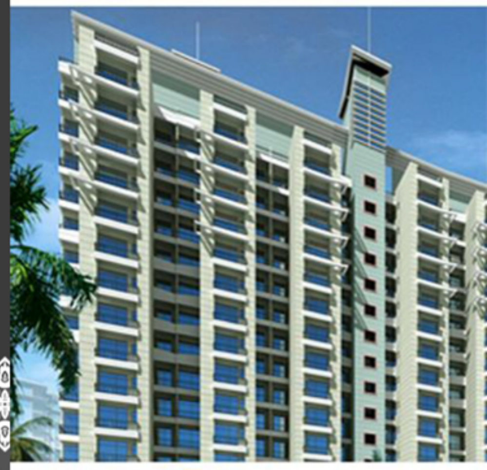
Devika Gold Homz