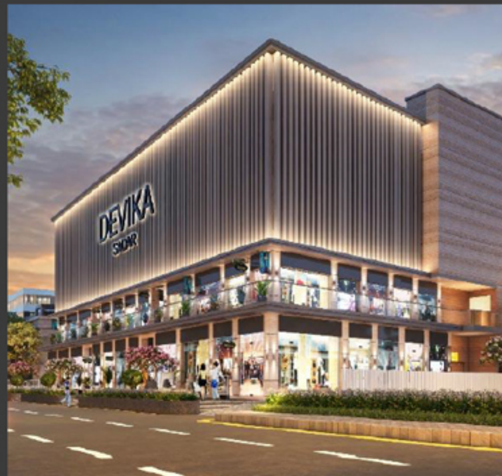
Devika Sadar Bazaar