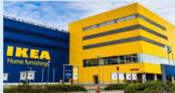
IKEA is all set to begin work of its biggest store in Noida