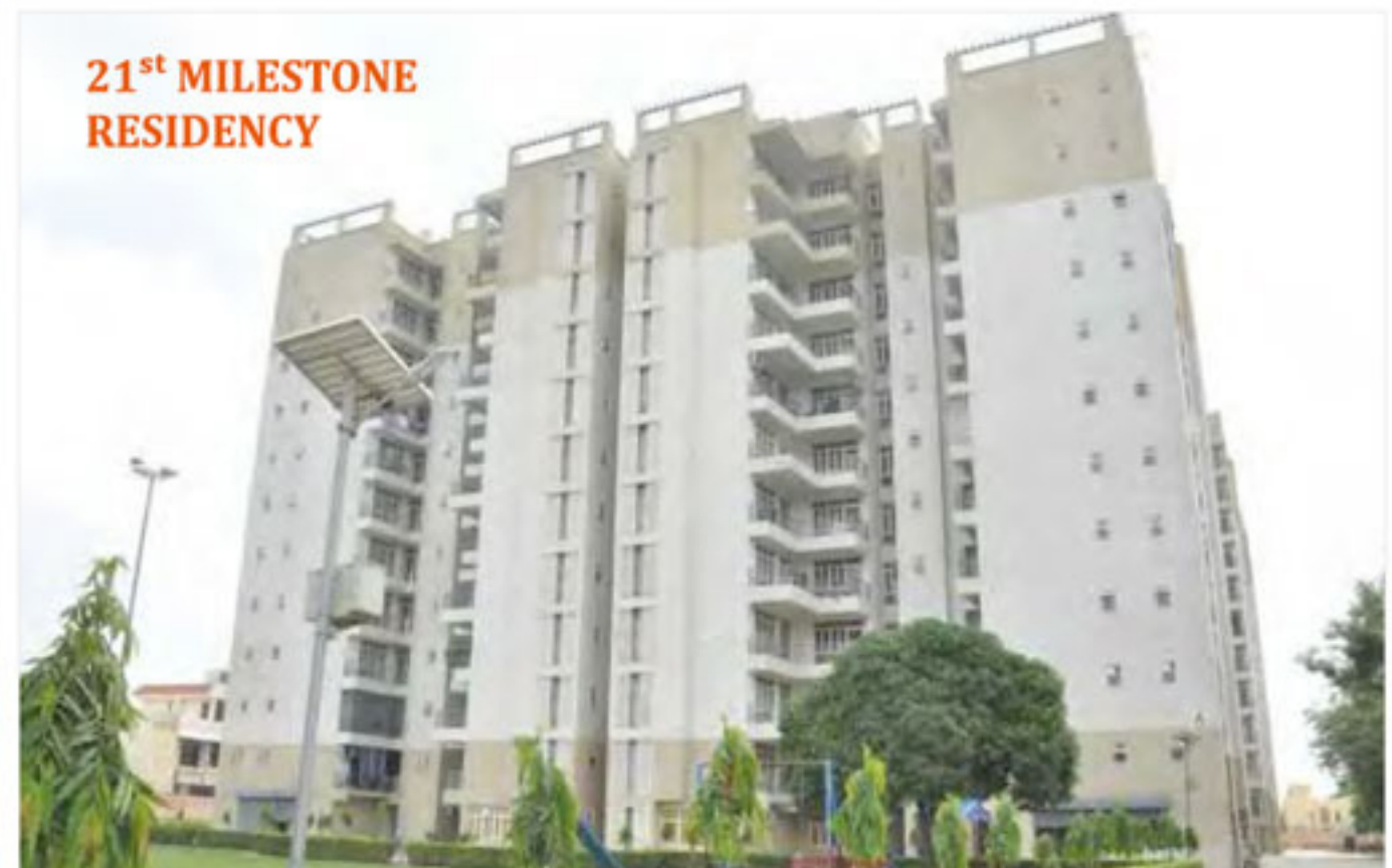
Rajnagar Ghaziabad | 2 & 3 BHK Apartments