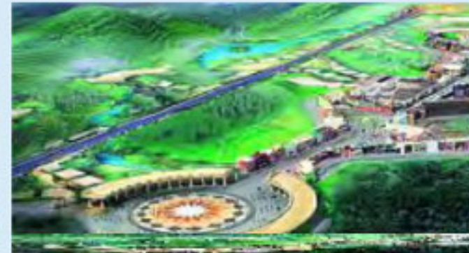
Proposed Film City