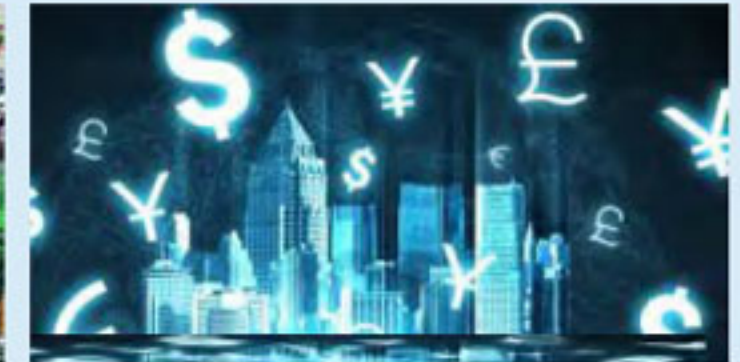
50 investment proposals worth Rs 7,000 crore from international investors

Existing upcoming projects are just a small indicator of Noida's growth potential.