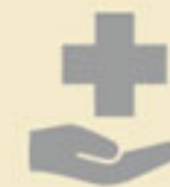
Health care facilities