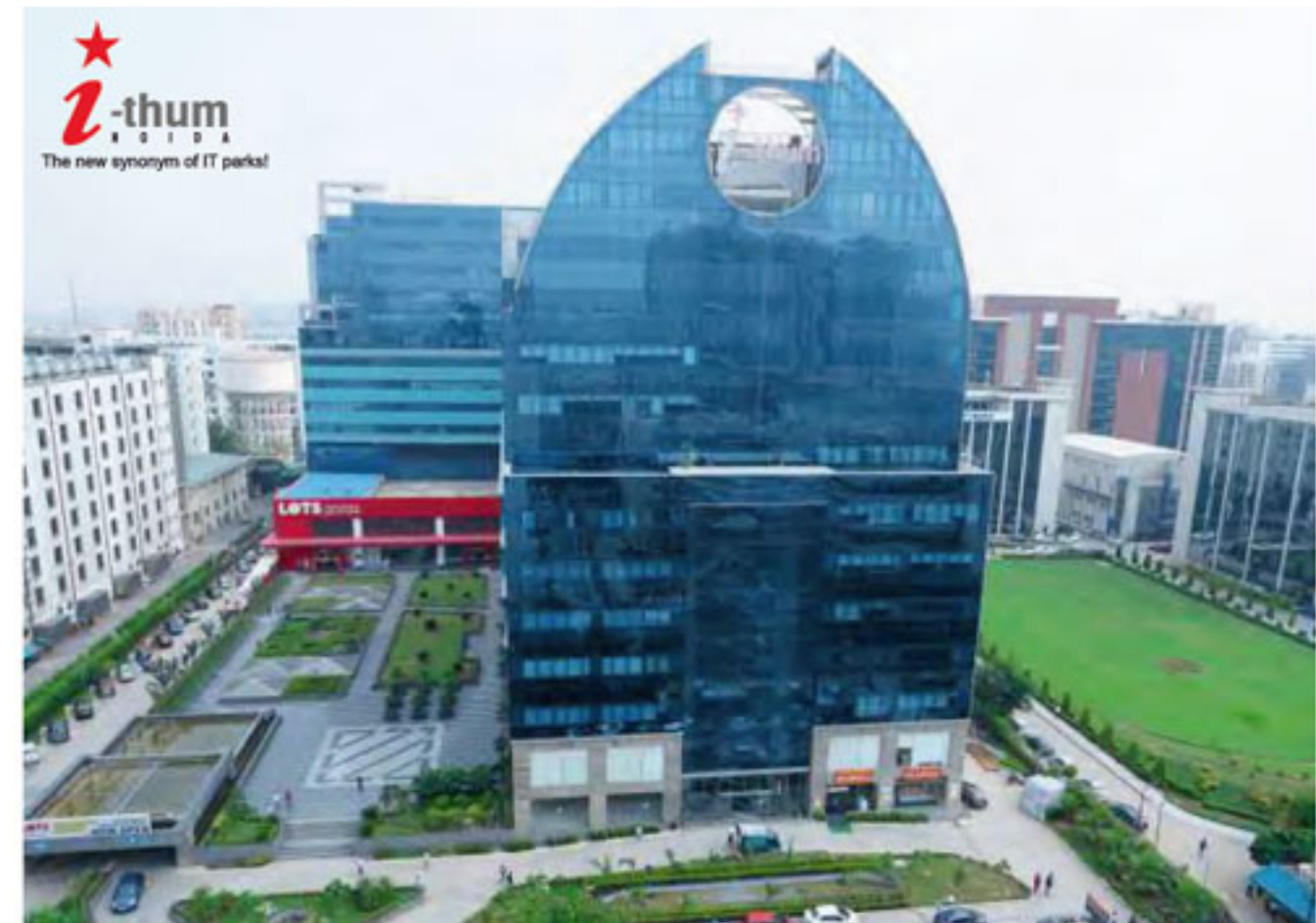
IT PARK | Sector 62, Noida