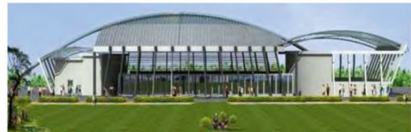
ICE SKATING RINK & INDOOR STADIUM | Dehradun , Uttarakhand