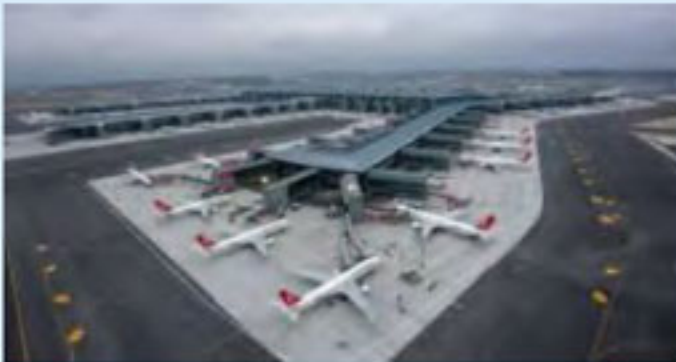
Jewar International Airport

There is no denying the fact that NOIDA is 'the investment hotspot' for the real estate sector in North India