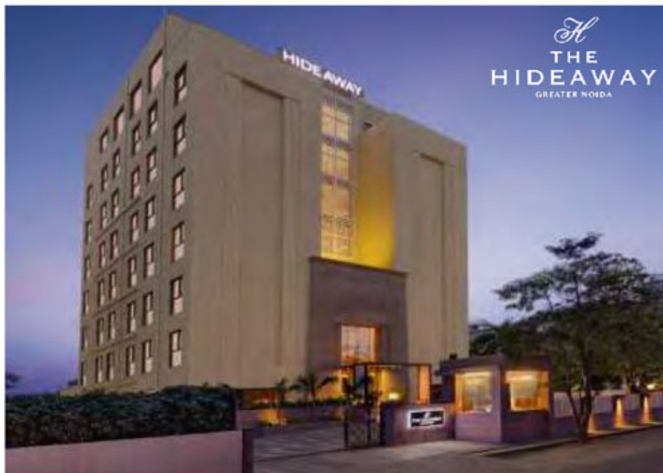
HOTEL | Knowledge Park 1, Greater Noida