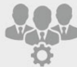
The establishment of companies