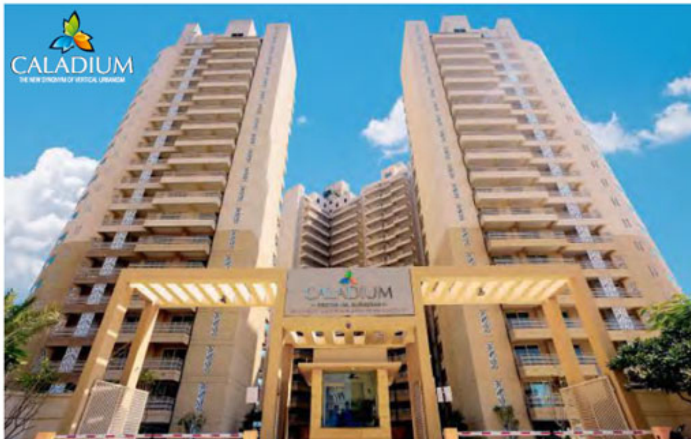
Sector 109, Gurugram | 3 & 4 BHK Apartments & Penthouses