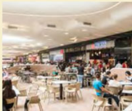
Assorted food hall

While the retail center is sure to attract a vibrant mix of high street retail, experiential stores, and luxury brands, Tastefully designed Gourmet Galleria is conceived to deliver a tantalizing experience for the entire spectrum of visitors ranging from regular eatery seekers to enthusiastic foodies and experience seekers.