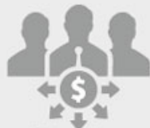
Attraction for investors